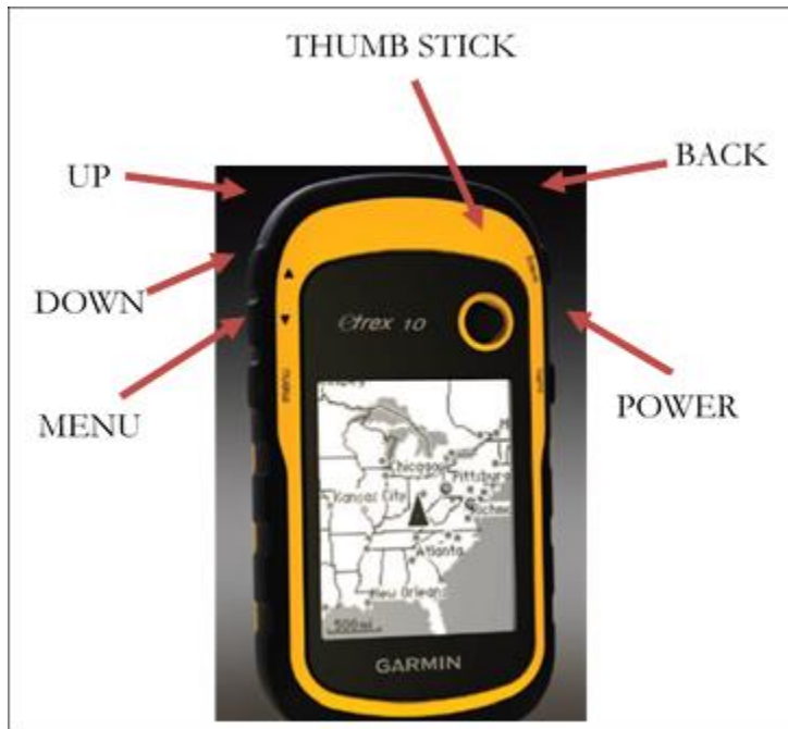
Figure 3: The buttons as they appear on the GPS Etrex unit.